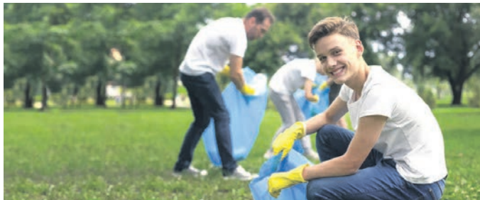
Youth are committed to causes, but they don't have the same attachments to individual organizations that older generations did.

Young people need to see the impact of the work an organization is doing and feel connected with the cause. They want to feel inspired and have their voices heard. We've seen this with the climate strikes around the world – youth are fed up with perceived inaction by older