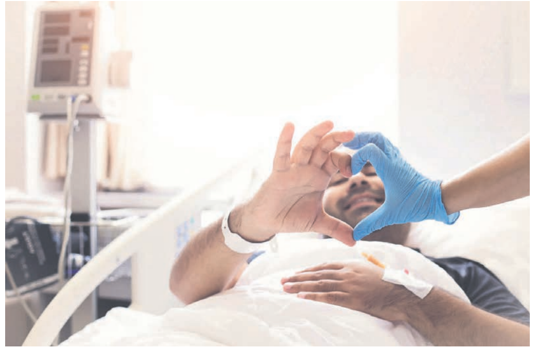
From the heart, for the heart: For over 10 years the Schulich Heart Centre's minimally-invasive structural heart program at Sunnybrook was supported by philanthropic support saving hundreds of lives.

says. "With ever-evolving technology, there's never been a time in which the impact of philanthropy in health and medical sciences has been greater."