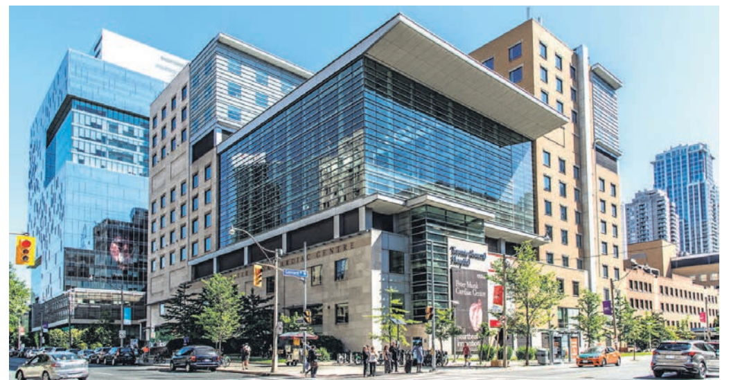
Many world firsts have been recorded at Toronto General Hospital, contributing to its global reputation for excellence.

While the hospital appreciates large, transformational gifts, the combination of big and small donations through Toronto General & Western Hospital Foundation helps to support research, acquire equipment that might otherwise not be available and enable participation in the international research community.