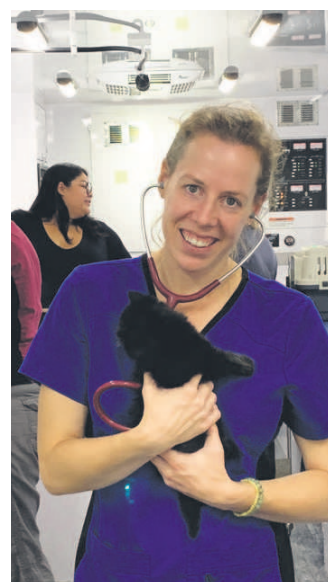
The Ontario SPCA and Humane Society delivers services to pets in under-served communities.

"Ontario is a very big province, and some communities live hours