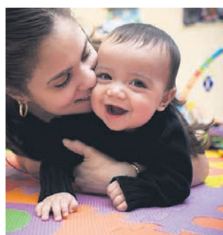
Youville Centre's programs help parenting youth access their strengths and achieve their goals.