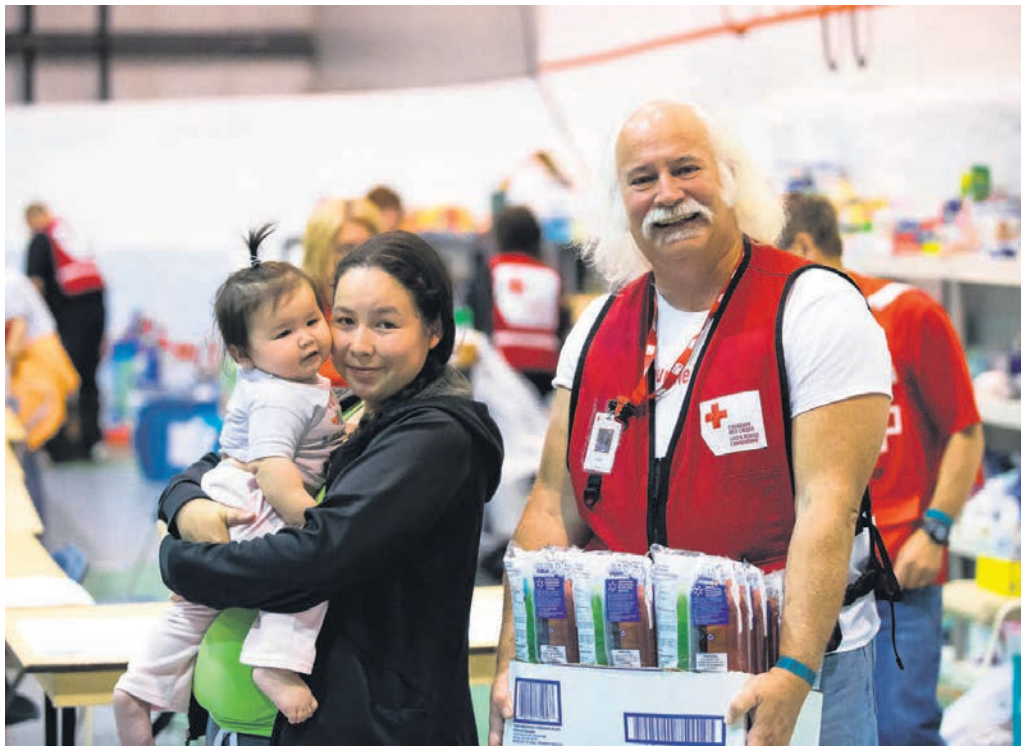
The Canadian Red Cross provides disaster relief during times of crisis.

While the Canadian Red Cross has been working with Indigenous communities in Manitoba for many years with the support of the federal government and other partners, a transformational gift by The Sprott Foundation in 2016 enabled the humanitarian organization to develop new ways, alongside Indigenous